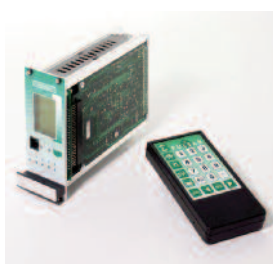
19" rack mount