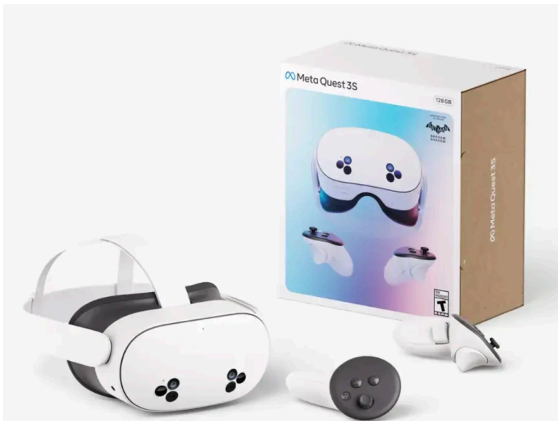
Meta Quest 3S 128GB