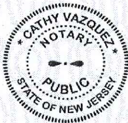
A NOTARY PUBLIC OF NEW JERSEY My Commission Expires Mar. 27, 2014

IN TESTIMONY WHEREOF, I have hereunto set my hand affixed my Official Seal, at the City of Newark, New Jersey the day and year first above written.