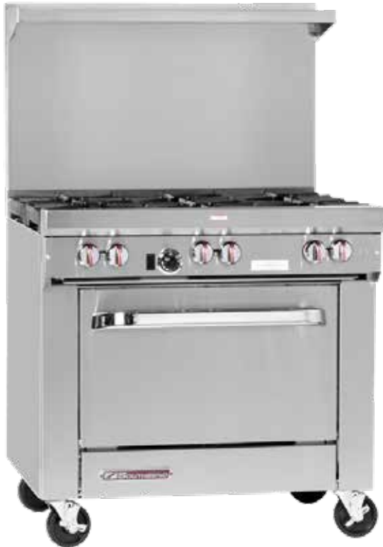
S36D (shown with optional casters)