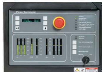
PowerCommand 2100 control operator/display panel