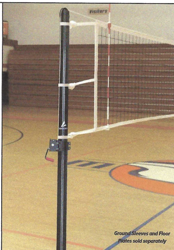
Ground Sleeves and Floor Plates sold separately