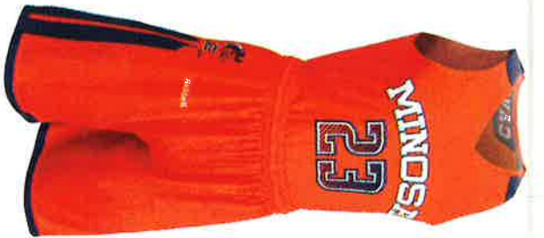
Minosa - MIN-17