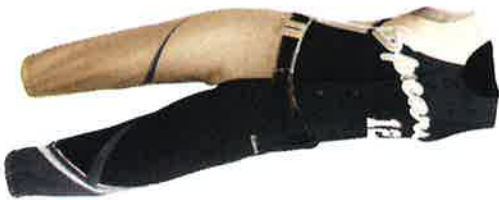
Tigers - TIGERS-16