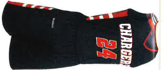
Chargers - CHA-16