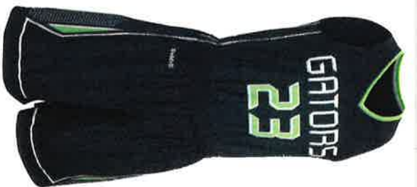
Gators - GTS-16