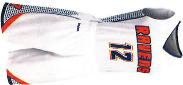
Ravens - RVS-16