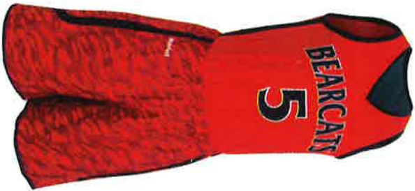
Bearcats - BCT-16