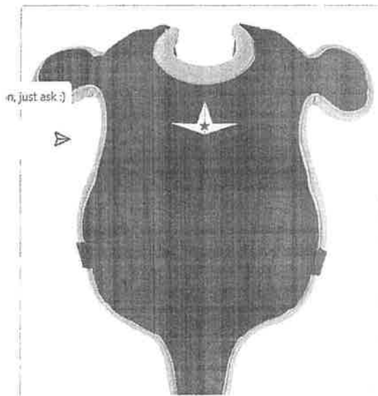
All-Star Future Star Series Youth 14.5 Inch Chest Protector