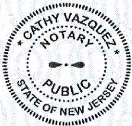
A NOTARY PUBLIC OF NEW JERSEY My Commission Expires Mar. 27, 2014

IN TESTIMONY WHEREOF, I have hereunto set my hand affixed my Official Seal, at the City of Newark, New Jersey the day and year first above written.